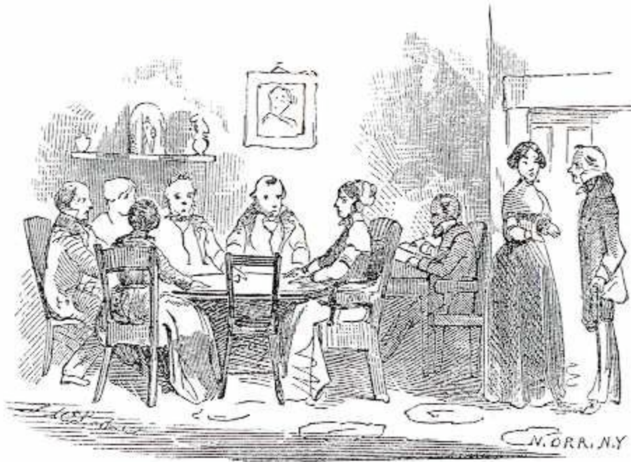
A CIRCLE OF SPIRIT-RAPPERS IN SESSION.

Spiritualism was something that many people talked and thought about a lot during its times of greatest popularity – in the mid to late 1800s and after World War I (1918 to the mid-1920s.) It showed up as the subject of songs, books, art, etc. Check out the following examples.